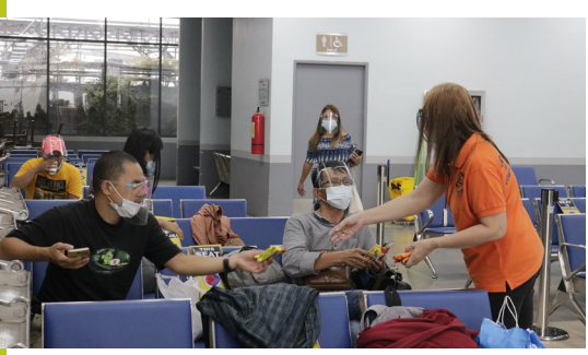
Distribution of free light snacks was also conducted in separate partnership with the Philippine Coast Guard and PCG Auxiliary.