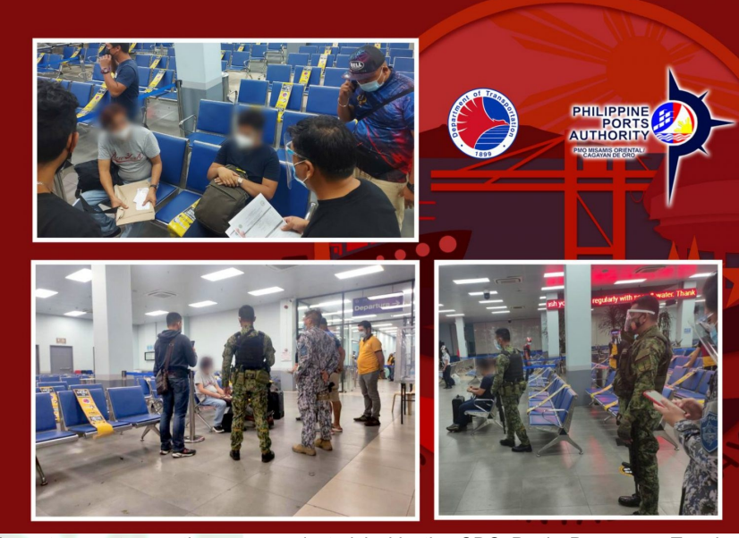
An entrapment operation was conducted inside the CDO Port's Passenger Terminal Building to capture the subject individuals upon their trip departure schedule.

The said passengers who were supposed to travel for Bohol were caught faking their RT-PCR test results which they presented to the Regional Inter-Agency Task Force of the Management of Emerging Infectious Diseases (RIATF-MEID) of Bohol prior to their travel, after the latter verified the said document to the Department of Health (DOH) and found out that their names were not in the agency's database of recorded individuals who underwent RT-PCR test. DOH informed and coordinated with the Port Police and an entrapment operation was conducted together with the