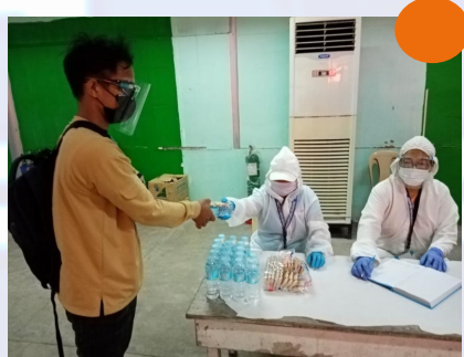
Distribution of free light snacks at CDO Port