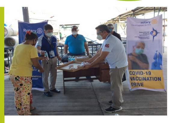
The PMO MO/C in partnership with Rotary Club of CDO, and Pepsi-Cola Philippines, gave free light snacks to vaccinated passenger at the Baseport

In another collaboration, the PMO partnered with the 1001<sup>st</sup> Auxiliary Squadron of the Philippine Coast Guard Auxiliary (PCGA), the civilian support group of the Philippine Coast Guard for the provision of free light snacks to vaccinated passengers at the Baseport on 09 September 2021.