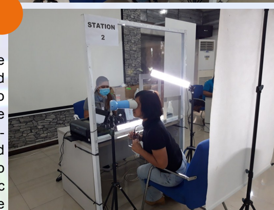
entire duration of the activity. Biometric information are collected from the regis-Personnel will only proceed to trants such finger prints (above photo), and eye photos (bottom photo)