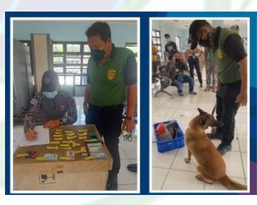
The PDEA personnel itemized the objects seized from the suspect.

The Port Police personnel intercepted illegal drugs brought by a truck driver during the security screening at CDO Port's Access Control Center on 09 September 2021.