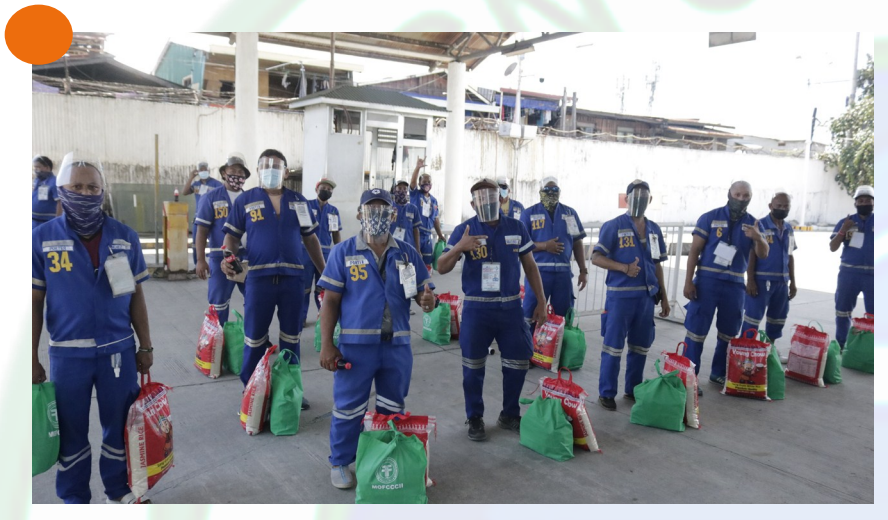
The porters assigned at CDO Port posed for a photo bringing their food packs.

The activity was organized not only to help ease the economic burden of the porters and their respective families but also to give recognition of their frontline service despite the prevailing COVID-19 threat. Also, this activity is in harmony with the government's call for bayanihan, that is, helping one another especially the frontliners and the most vulnerable sector, so together the country can win over this crisis and heal as one.