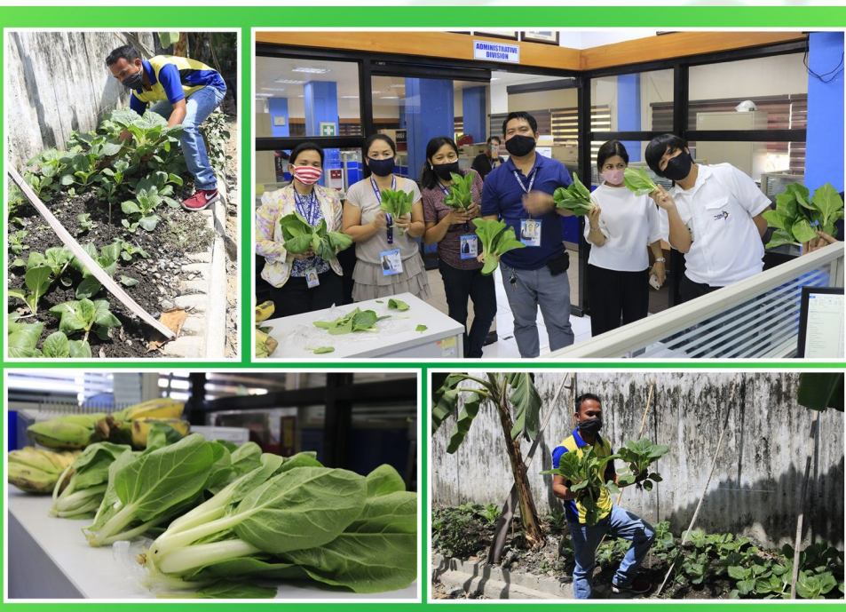
PMO personnel sharing the harvests from the vegetable garden.

As the Port of Cagayan de Oro remains operational amid COVID-19 pandemic as being