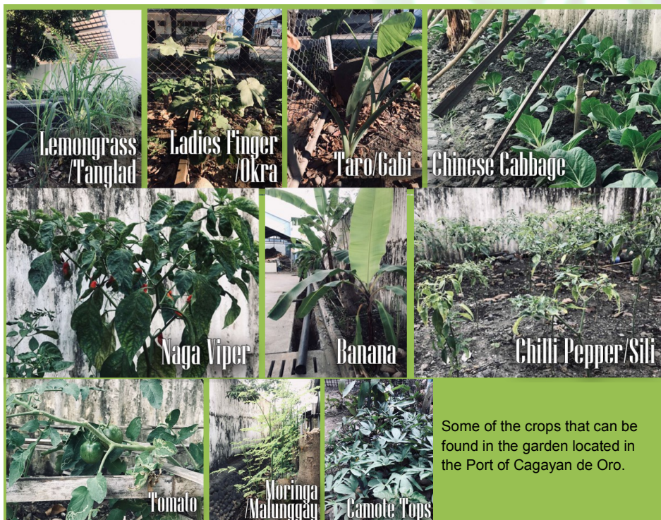
Some of the crops that can be found in the garden located in the Port of Cagayan de Oro.

The CDO Port is a Green Port recognized by the APEC Green Port Award System (GPAS). The establishment and maintenance of this vegetable garden does not only help maintain the "green" environment amidst the hustle and bustle of the Baseport, but most importantly for the PMO to have a source of safe, clean, and organic foods to support good health, an armor against diseases such as the prevailing COVID-19.