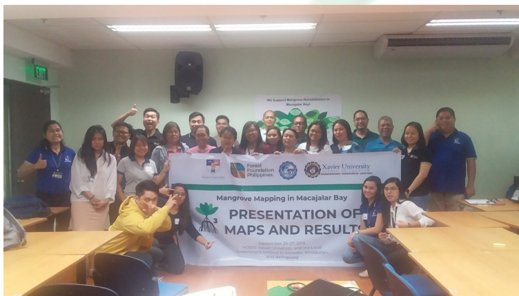
The participants together with the XU-MMC personnel posed for a photo after the Mangrove Mapping Project Forum.

The mapping project worked on the profiles of mature, newly-planted mangroves, the recommended mangrove species to be planted, and the potential mangrove planting sites in Macajalar Bay where the Port of Cagayan de Oro is situated. The forum was conducted to elicit inputs