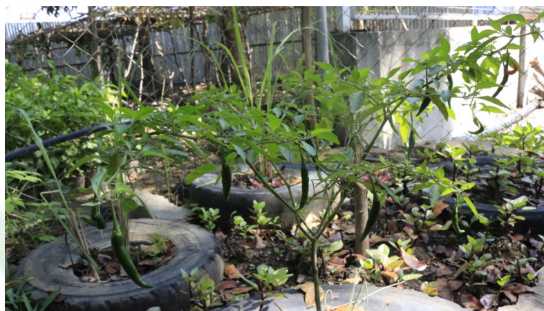
Chili pepper Scientific name: Capsicum annum L.