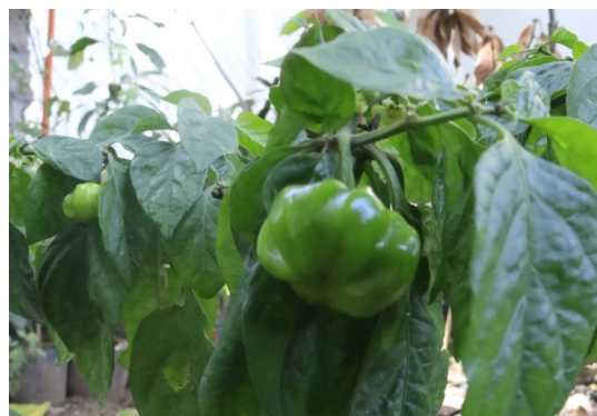
Scientific name: Capsicum annuum