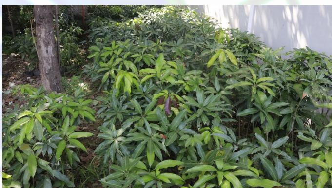
Mango Tree seedlings Scientific name: Mangifera Indica. L.