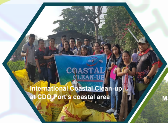
International Coastal Clean-up at CDO Port's coastal area

Philippine Ports Authority — Port Management Office of Misamis Oriental/Cagayan de Oro (PMO MO/C), the lead agency for the 24 th National Maritime Week Celebration, successfully hosted the annual celebration in cooperation with other maritime agencies and institutions in Cagayan de Oro City including the Maritime Industry Authority (MARINA), the Philippine Coast Guard (PCG), maritime schools and shipping lines on September 21-27, 2019.