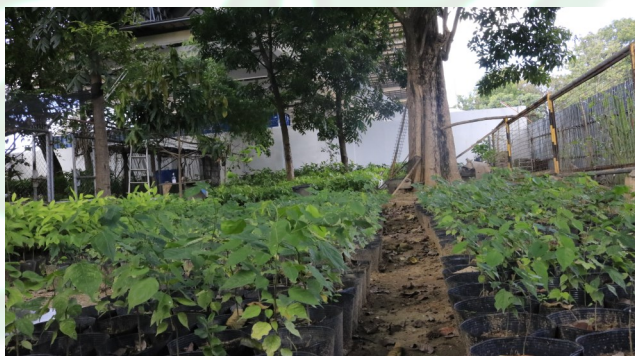
Mahogany (foreground) Scientific name: Swietenia mahagoni