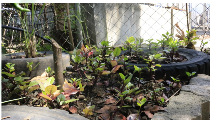
Malabar Spinach ("alugbati") Scientific name: Basella alba