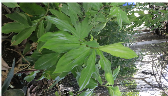
Insulin Plant Scientific name: Chamaecostus cuspidatus