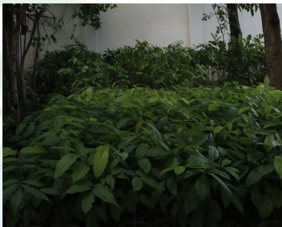
Durian Tree seedlings Scientific name: Durio