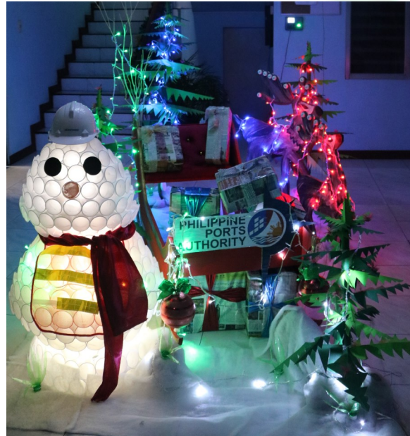
PMO MO/C entry depicting a "White Christmas"

The entry of the Port Management Office of Misamis Oriental/Cagayan de Oro depicts the white Christmas of the western countries through the display of ubiquitous figures during the winter season—the popular snowman, fir trees, and the reindeer with its sleigh. The snowman was made of white plastic cups lumped around the outlined