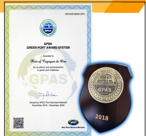
The Green Port Award System (GPAS) certificate and the badge.

The PMO MO/C’s entry entitled, “Philippine Ports Authority—Port Management Office of Misamis Oriental/Cagayan de Oro (PMO MO/C): Fostering a Green Culture for Port Operations and Management,” highlights its initiatives for environmental protection, conservation, and sustainability through the employment of technology Page 3