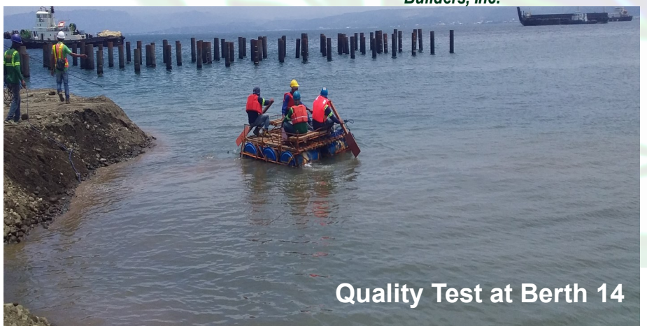
Quality Test at Berth 14