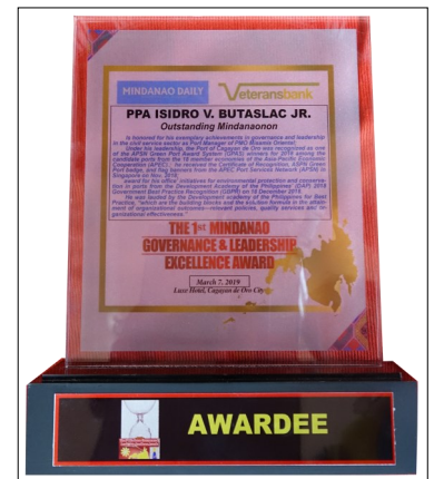
The 1st Mindanao Governance Leadership Excellence Awards 2019 Plaque

effect positive changes in their respective communities and organizations that beget into winning various achievement awards. The award-giving body presented awards to leaders under various categories: a.) government sector—national, provincial, municipal, and barangay LGUs; and Civil Service; b) private sector—civic organizations, NGOs, social clubs, and youth.